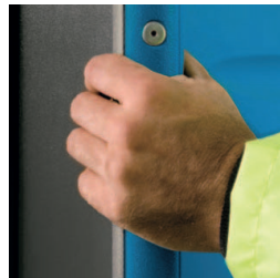
Easy-grip Handhold area