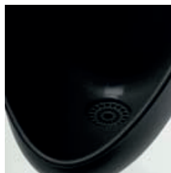
Integrated urinal screen