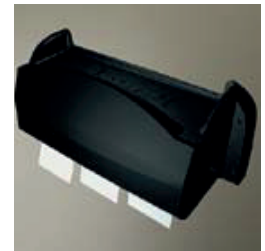
Three roll toilet holder with built in shelf