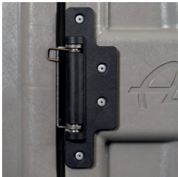
Heavy Duty Spring w/ protective cover